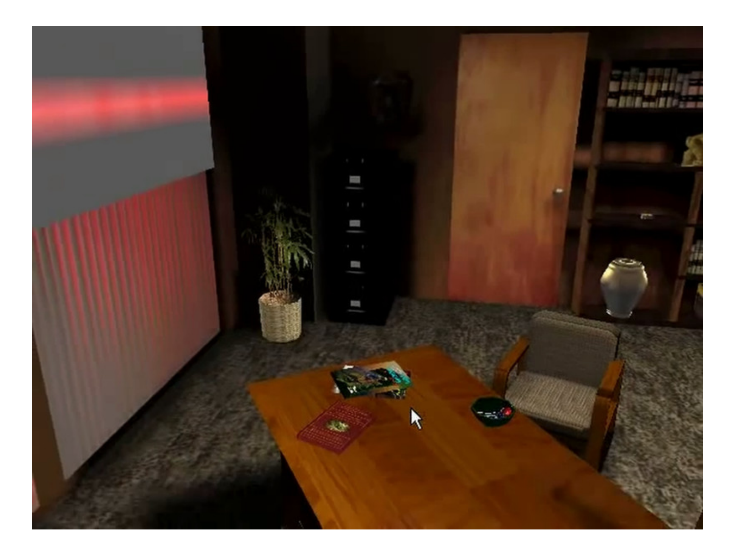
Tex Murphy: Overseer Download For Windows

Download >>> <a href="http://bit.ly/2NIEoKF">http://bit.ly/2NIEoKF</a>